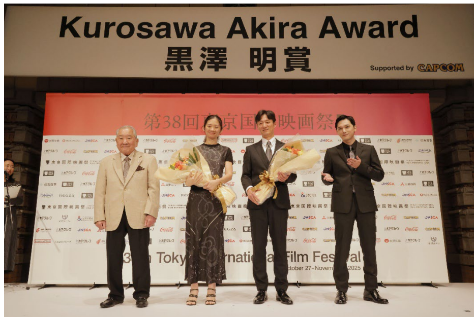
Presenter Kenzo Tsujimoto and Akira Kurosawa Award winners Chloé Zhao ( Nomadland and Hamnet ) and Sang-il Lee ( Kokuhō ).

Imperial Hotel, Tokyo JAPAN | On Monday, November 3, the 38th Tokyo International Film Festival hosted the Akira Kurosawa Award ceremony and gala dinner at the Imperial Hotel.